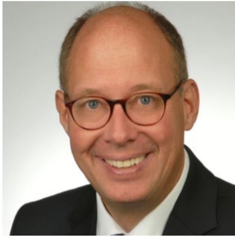
Dr Helge Braun Member of the Bundestag