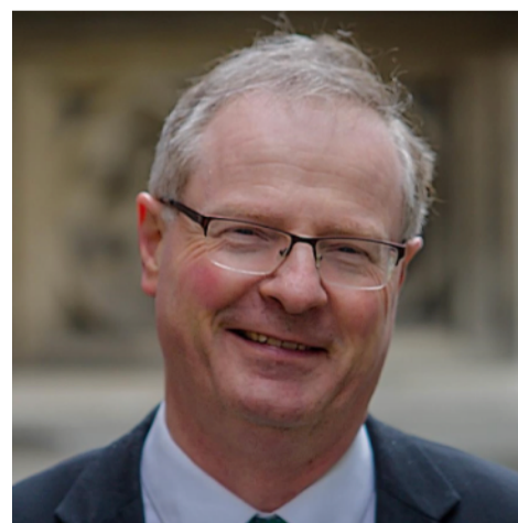
Jeremy Lefroy Uniting to Combat NTDs Ambassador