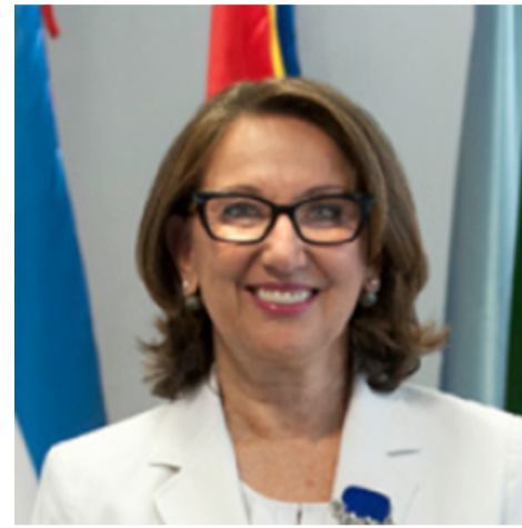
Rebeca Grynspan Former Chair of Uniting to Combat NTDs, now Uniting ambassador