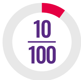
NTD mass treatment coverage index

This country profile provides an overview of Angola's progress in reaching everyone in need of treatment for the five most common NTDs, based on 2017 data reported to the World Health Organization (WHO) by the country. This information is used to calculate the NTD index that appears in the African Leaders Malaria Alliance (ALMA) Scorecard for Accountability and Action, and is used for SDG 3.3 and Universal Health Coverage (UHC) reporting.