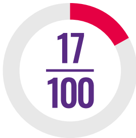
NTD mass treatment coverage index

This country profile provides an overview of Burundi’s progress in reaching everyone in need of treatment for the five most common NTDs, based on 2017 data reported to the World Health Organization (WHO) by the country. This information is used to calculate the NTD index that appears in the African Leaders Malaria Alliance (ALMA) Scorecard for Accountability and Action, and is used for SDG 3.3 and Universal Health Coverage (UHC) reporting.