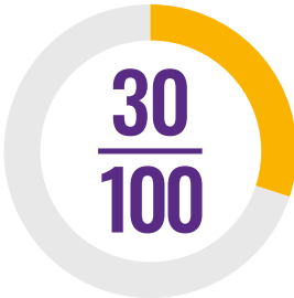
NTD mass treatment coverage index

This country profile provides an overview of Congo's progress in reaching everyone in need of treatment for the five most common NTDs, based on 2017 data reported to the World Health Organization (WHO) by the country. This information is used to calculate the NTD index that appears in the African Leaders Malaria Alliance (ALMA) Scorecard for Accountability and Action, and is used for SDG 3.3 and Universal Health Coverage (UHC) reporting.