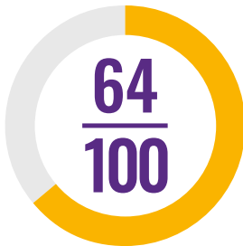
NTD mass treatment coverage index

This country profile provides an overview of Eritrea’s progress in reaching everyone in need of treatment for the five most common NTDs, based on 2017 data reported to the World Health Organization (WHO) by the country. This information is used to calculate the NTD index that appears in the African Leaders Malaria Alliance (ALMA) Scorecard for Accountability and Action, and is used for SDG 3.3 and Universal Health Coverage (UHC) reporting.