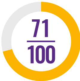
NTD mass treatment coverage index

This country profile provides an overview of Liberia’s progress in reaching everyone in need of treatment for the five most common NTDs, based on 2017 data reported to the World Health Organization (WHO) by the country. This information is used to calculate the NTD index that appears in the African Leaders Malaria Alliance (ALMA) Scorecard for Accountability and Action, and is used for SDG 3.3 and Universal Health Coverage (UHC) reporting.