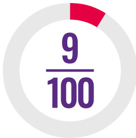
NTD mass treatment coverage index

This country profile provides an overview of Madagascar's progress in reaching everyone in need of treatment for the five most common NTDs, based on 2017 data reported to the World Health Organization (WHO) by the country. This information is used to calculate the NTD index that appears in the African Leaders Malaria Alliance (ALMA) Scorecard for Accountability and Action, and is used for SDG 3.3 and Universal Health Coverage (UHC) reporting.