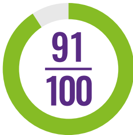
NTD mass treatment coverage index

This country profile provides an overview of Malawi’s progress in reaching everyone in need of treatment for the five most common NTDs, based on 2017 data reported to the World Health Organization (WHO) by the country. This information is used to calculate the NTD index that appears in the African Leaders Malaria Alliance (ALMA) Scorecard for Accountability and Action, and is used for SDG 3.3 and Universal Health Coverage (UHC) reporting.