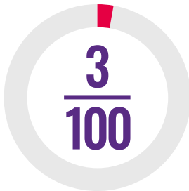
NTD mass treatment coverage index

This country profile provides an overview of Mauritania's progress in reaching everyone in need of treatment for the five most common NTDs, based on 2017 data reported to the World Health Organization (WHO) by the country. This information is used to calculate the NTD index that appears in the African Leaders Malaria Alliance (ALMA) Scorecard for Accountability and Action, and is used for SDG 3.3 and Universal Health Coverage (UHC) reporting.