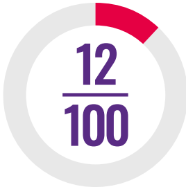
NTD mass treatment coverage index

This country profile provides an overview of Mozambique’s progress in reaching everyone in need of treatment for the five most common NTDs, based on 2017 data reported to the World Health Organization (WHO) by the country. This information is used to calculate the NTD index that appears in the African Leaders Malaria Alliance (ALMA) Scorecard for Accountability and Action, and is used for SDG 3.3 and Universal Health Coverage (UHC) reporting.