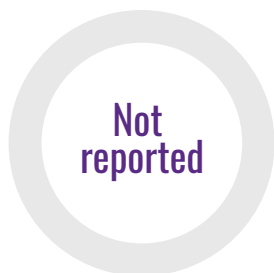
NTD mass treatment coverage index

This country profile provides an overview of Sao Tome and Principe's progress in reaching everyone in need of treatment for the five most common NTDs, based on 2017 data reported to the World Health Organization (WHO) by the country. This information is used to calculate the NTD index that appears in the African Leaders Malaria Alliance (ALMA) Scorecard for Accountability and Action, and is used for SDG 3.3 and Universal Health Coverage (UHC) reporting.