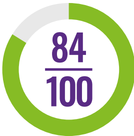
NTD mass treatment coverage index

This country profile provides an overview of Togo's progress in reaching everyone in need of treatment for the five most common NTDs, based on 2017 data reported to the World Health Organization (WHO) by the country. This information is used to calculate the NTD index that appears in the African Leaders Malaria Alliance (ALMA) Scorecard for Accountability and Action, and is used for SDG 3.3 and Universal Health Coverage (UHC) reporting.