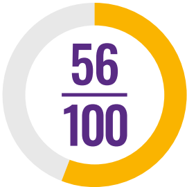
NTD mass treatment coverage index

This country profile provides an overview of Zambia’s progress in reaching everyone in need of treatment for the five most common NTDs, based on 2017 data reported to the World Health Organization (WHO) by the country. This information is used to calculate the NTD index that appears in the African Leaders Malaria Alliance (ALMA) Scorecard for Accountability and Action, and is used for SDG 3.3 and Universal Health Coverage (UHC) reporting.